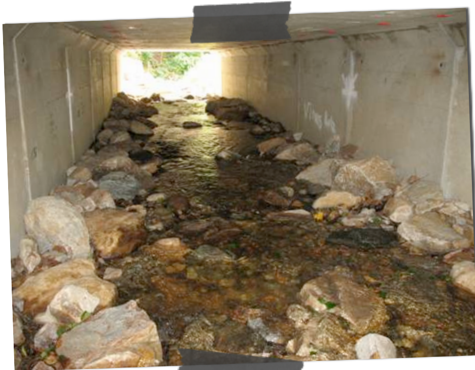
AOP friendly box culvert constructed by the Vermont Transportation Agency in Readsboro, VT.