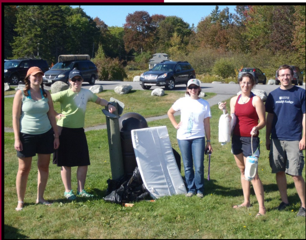
UMaine Student Subunit members cleaning up Lamoine State Park