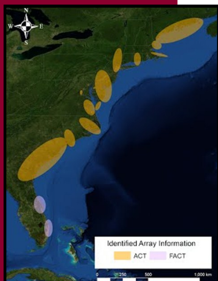
The Act Network (source, www.theactnetwork.com )

"The intention of session organizers was to highlight telemetry research, as well as generate discussion and collaboration across species"